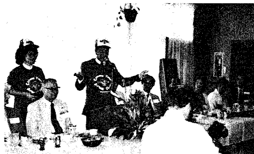
◁ 商工会議所主催の 歓迎式