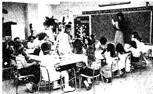
◁ 私立の小学校 (小・中・高同一校)

午前8時 11時30分 7時 4時 9時 ロータリークラブ による歓迎式(テ イモシーズ教会) ナッシュビル市 内見学(第七代大 統領アンドリュウ ・ジャクソン邸、 骨董品街・私立校 調印式・パーティ ー(ブルーグラス カントリークラブ)